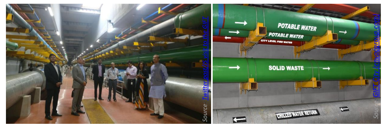
Photograph 3 Underground utility Tunnel (7.6m x 6.2 m) for transport

GIFT City is equipped with strategically placed automated waste collection units. These units are designed to handle specific waste streams and are connected to an underground waste collection network. Each unit has separate inlets for different waste categories, ensuring proper disposal and minimizing contamination.