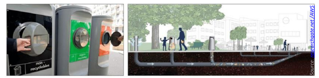
Photograph 2 Disposal chutes in buildings and in Public Places for waste collection

buildings and in public spaces as shown in photograph 02. These chutes shall be automated and citizen may use their electronic cards to open and access these disposal chutes.